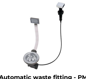
Automatic waste fitting - PM 8407 113